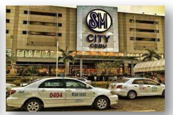
SM Cebu City