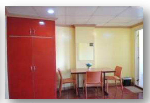
Closet & table