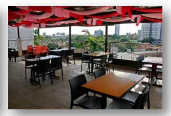
Café with view