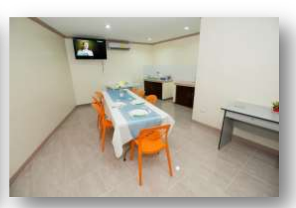
Relax zone 2